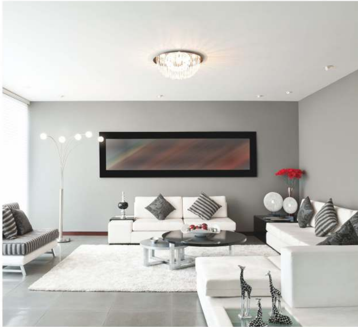
Exhilarated and Amusing Lifestyle