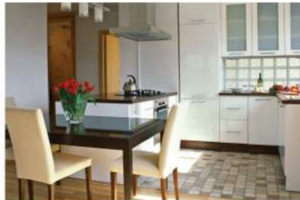
Smell the Savour of Spices for the Tempting Cooking