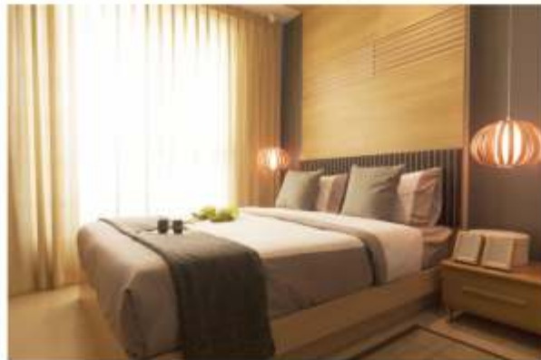
Tranquil and Blissful Sleep that makes you Free Spirited