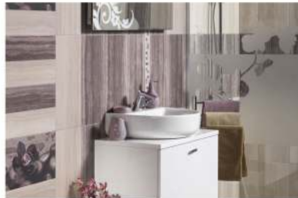
Every Single Corner is Thoughtfully Designed