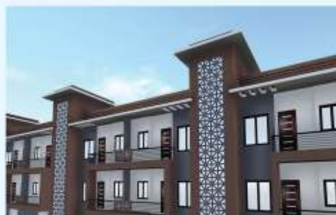
1,2 & 3 BHK FLATS

Located in the prime location of the city for pleasurable Living. Adore the affluence in landscape and expend quality moment with your family in an unlocked ambiance. Get yourself blessed in the midst of alluring designed landscape with peace and tranquility inhabiting in the intact aura.